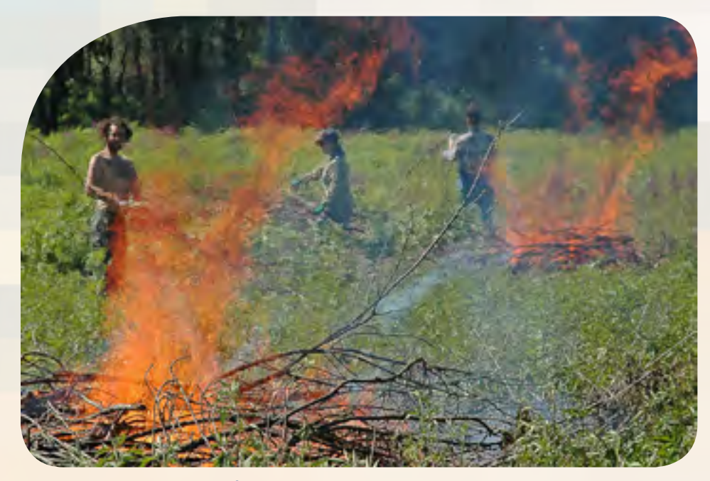
First prize: Revitalization of wet meadows in Obedska bara Special Nature Reserves © Vladimir Dobretic.

The <u>QualityDestination</u> programme, launched in 2013, encourages local action for biodiversity and sustainability across Europe. A self-assessment package was developed and tested in 10 municipalities. Targeted communication tools were developed, leading to increased local awareness of the importance of biodiversity.