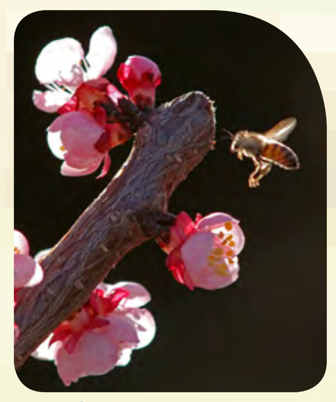
Pollination

ECNC also assisted in coordinating the activities of the Noord-Brabant Platform on Biodiversity and Society, including organizing two meetings and participating in regional-level events.