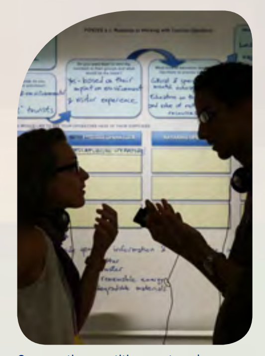
Conservation practitioners at work © D. Župan.

The ECNC Land & Sea Group started two new initiatives to promote sustainable tourism: <u>Bojanatour</u> and <u>QualityDestination</u>. Bojanatour promotes local economic development through diversification of recreational activities and products based on nature. The focus is on civil society involvement to build a common vision that contributes to good governance in coastal areas. The QualityDestination award programme aims to promote socially responsible tourism in defined places, while improving the destinations and the life quality of local people.